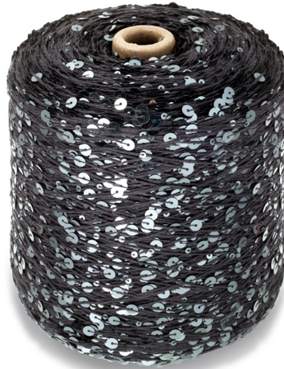
Example of effect yarn: Sequin yarn