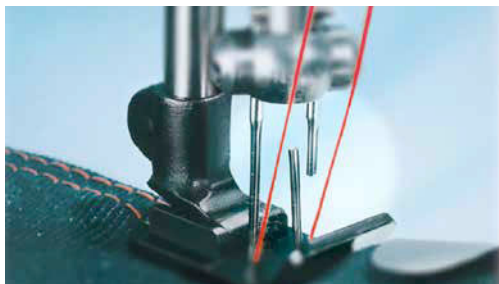
Needle breakage – if the needle is not stable enough