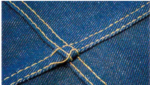
Skipped stitches – particularly when stitching over cross-seams

Skipped stitches and needle breakage often occur when the needle is heavily deflected when stitching over cross seams. The high penetration forces that occur when sewing medium to heavy materials (e.g. denim and work clothing) increase this risk even further.